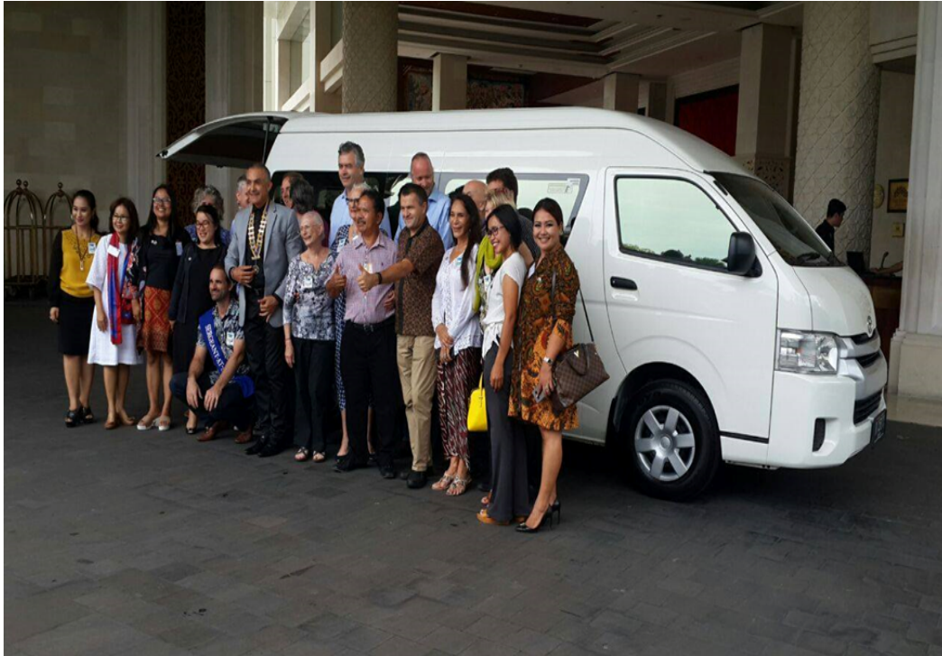
Customized Bus donated to Puspadi by RCBS in 2019