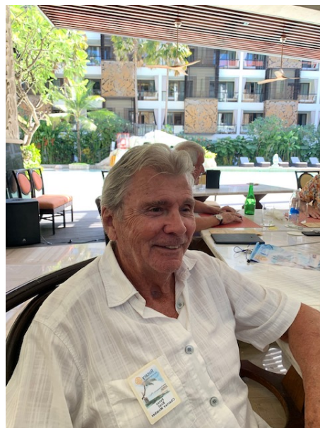
Our friend, former Rotarian