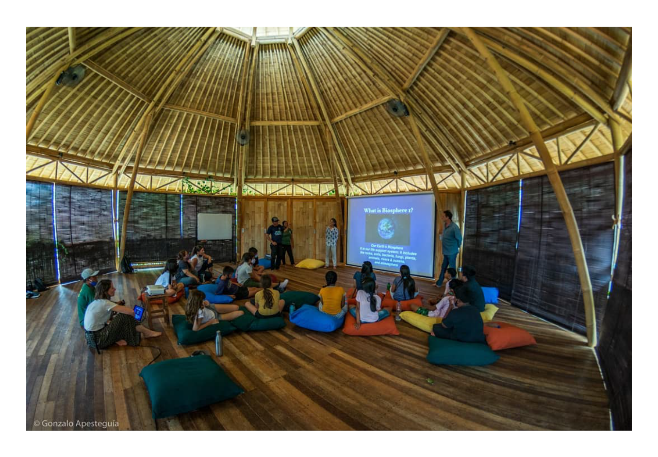
Biosphere Educational Center